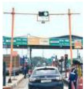
ECI has asked the NHAI to defer toll fee hike. RAJUV

The Election Commission of India (ECI) has asked state-owned NHAI to go ahead with the calculation of new user fee (toll) rates on highways, which kicks in annually from April 1 across most of tolled highway stretches in the country, but said the new rates should be applicable only after the Lok Sabha elections.