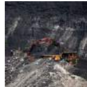
Total coal supplies hit 753.5 mt during FY24

State-run coal miner Coal India marginally fell short of its annual production target for the last fiscal as it produced 773.6 million tonnes in the last financial year against the target of 780 million tonnes.