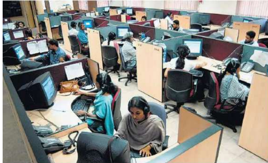
JOB GAP. IT sector will ramp up hiring by 12-15 per cent y-o-y in Q1FY25, says Teamlease

TCS improved its headcount by 5,452 employees as it added nearly 11,000 new associates in the June quarter. Net positive addition came after India's largest IT firm had re-