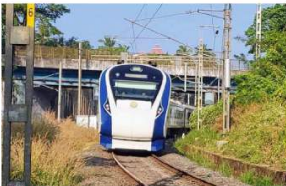
TOP-NOTCH. According to the Budget, 40,000 normal rail bogies (older version or traditional coaches) will be converted to Vande Bharat standards

Indian Railways has proposed an investment of at least ₹11,00,000 crore across three upcoming freight and cargo corridors - the energy, mineral and cement corridor, the port connectivity corridor, and the high-traffic density corridors. The corridors will include 434 smaller projects and lead to an addition of over 40,000 kms over the next six to eight years.